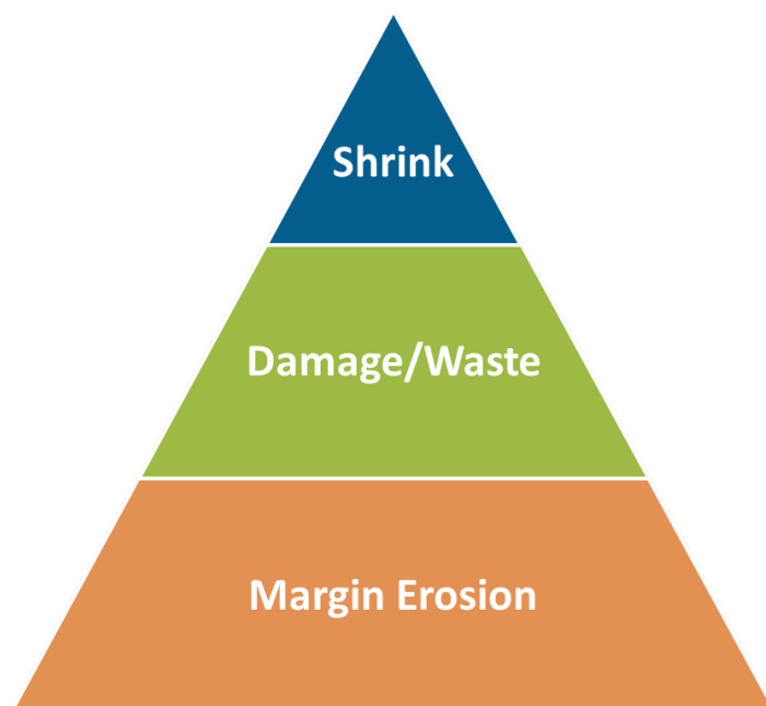
Opportunities for Profit Amplification

With thousands of transactional touch points throughout the retail value chain, optimizing and amplifying every profit opportunity is not feasible. Rather than inundating managers with every way that change could be implemented, Profitect highlights the highest priority actions that will provide the most Profit Amplification potential. With clearly defined areas of focus, resources in the retail enterprise can wisely implement changes that stimulate profit growth.